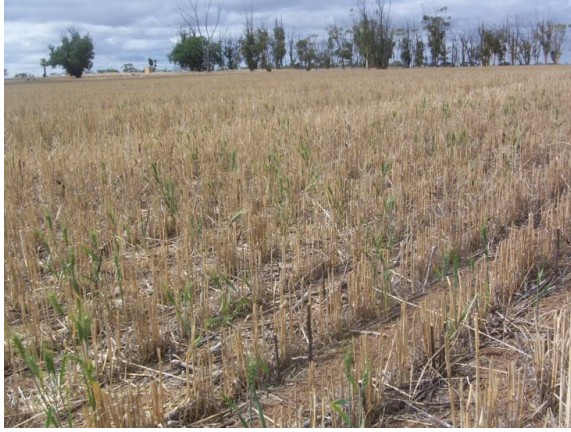
Typical volunteer wheat distribution across paddock

Heliotrope (flowering) Patches only, no uniform distribution 12 plants/m 2 in a typical patch