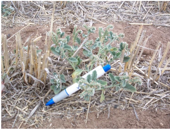
Average size of heliotrope

Heliotrope (flowering) Patches only, no uniform distribution 12 plants/m 2 in a typical patch