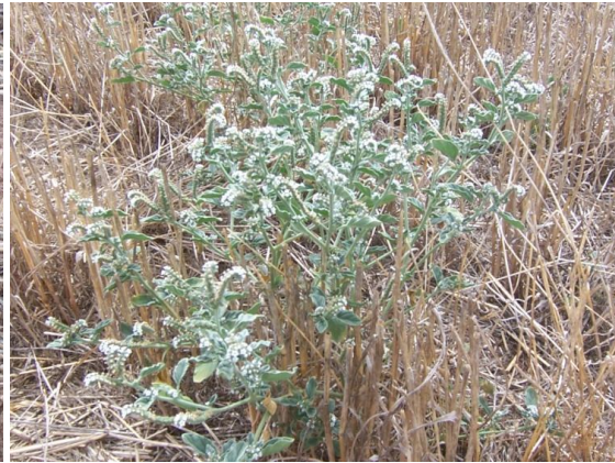
Larger heliotrope plants were also present