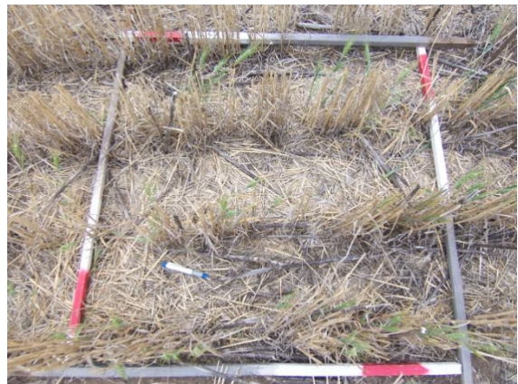
Typical volunteer wheat density in a 1m 2 quadrat