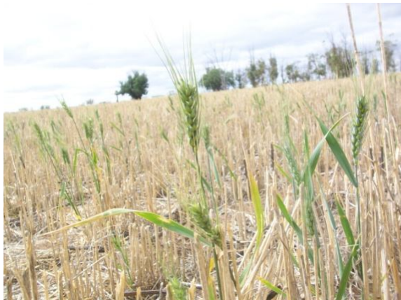
Volunteer wheat at head emergence