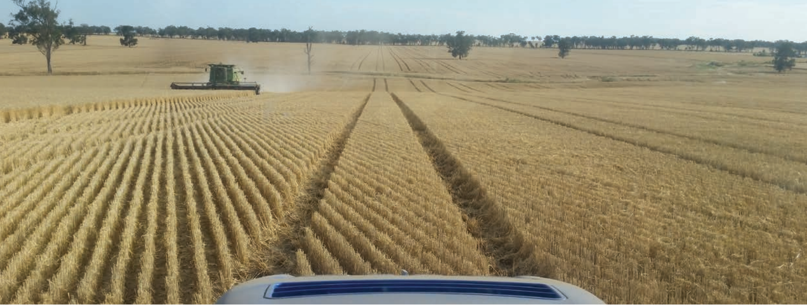
The 2015 harvest, taking off a 4.5t/ha wheat crop that was sown on a 15° angle.