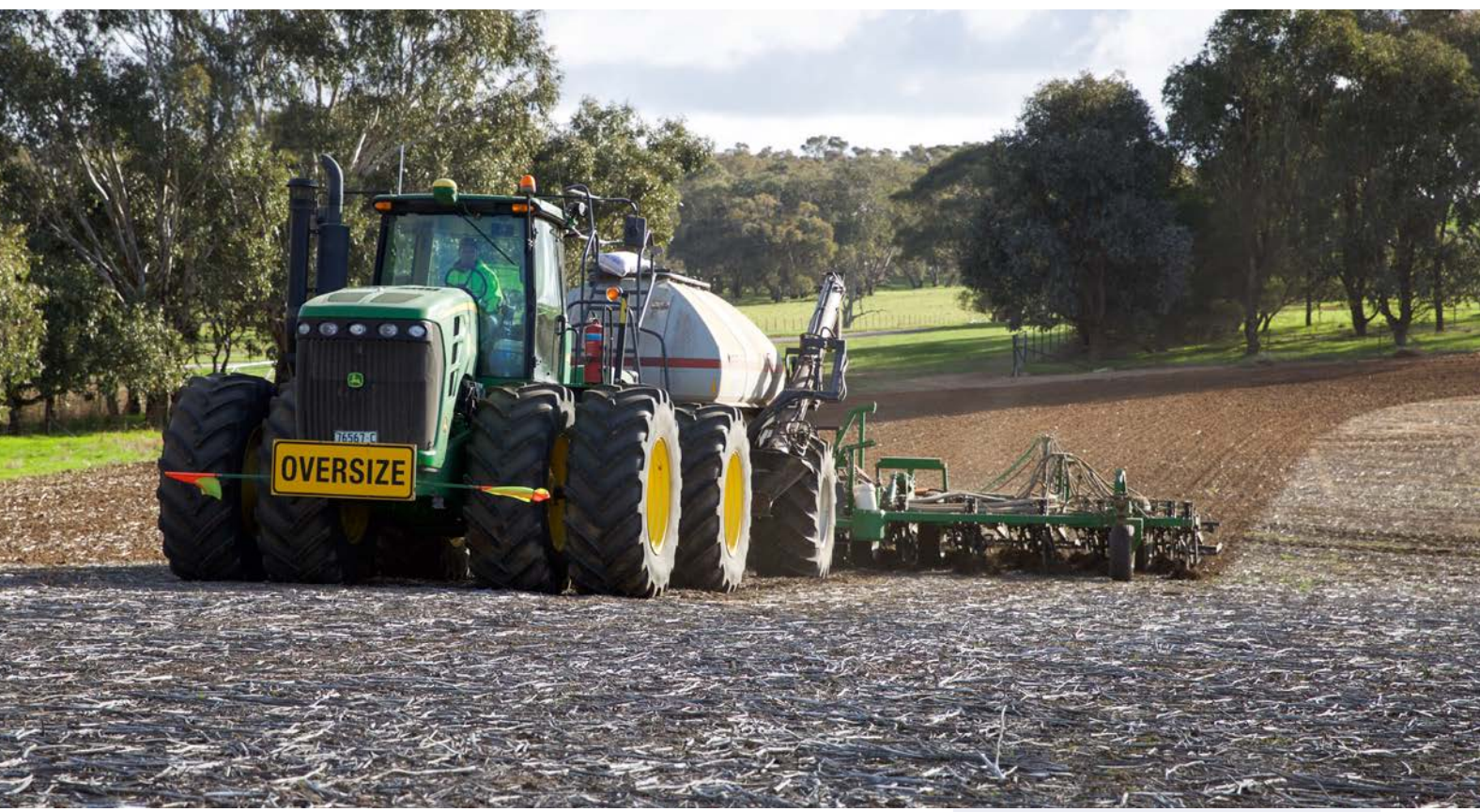
Canola stubble only receives treatment if pasture is being sown. Here the paddock was disc chained prior to being sown with harrows to assist with pasture establishment.