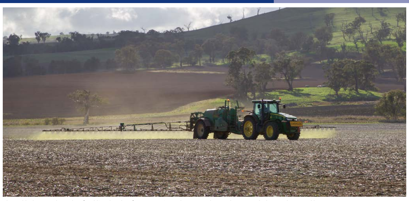
This paddock received 2.3L/ha of Yield® and 2L/ha of Gramoxone® pre-planting to wheat undersown with clover + chicory and lucerne.

Once canola is windrowed, the canola stubble receives no further treatment. At 308mm, the row spacing Rob uses is relatively wide for the region and environment in which he is cropping, but he chose it because it allows him to handle the canola stubble without harrowing.