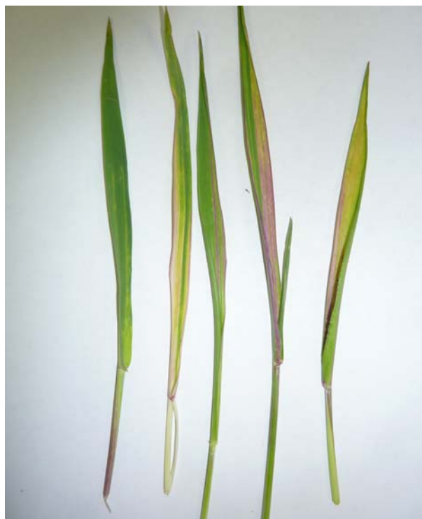
aphid feeding.

Leaf colour variation (left leaf) caused by Russian wheat