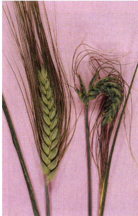
Wheat awns trapped by flag leaf damaged by Russian wheat aphid feeding (Photo source: Food and Agriculture Organisation, UN).

Feeding on open leaves causes the leaf to roll inwards around the aphid providing a suitable and protected microclimate. Infested flag leaves that remain unrolled trap the awns which prevents the wheat head from fully emerging and reduces grain fill.