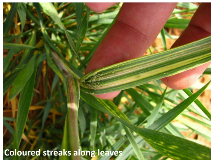
Coloured streaks along leaves