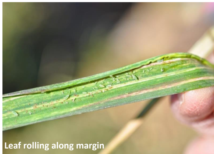
Leaf rolling along margin