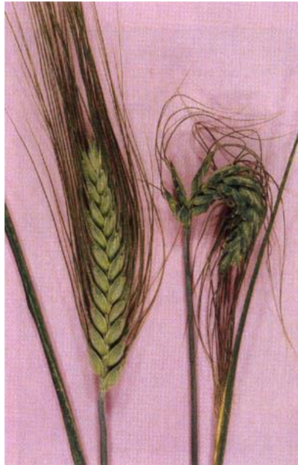
Wheat awns trapped by flag leaf damaged by Russian wheat aphid feeding (Photo source: Food and Agriculture Organisation, UN).

Feeding on open leaves causes the leaf to roll inwards around the aphid providing a suitable and protected microclimate. Infested flag leaves that remain unrolled trap the awns which prevents the wheat head from fully emerging and reduces grain fill.