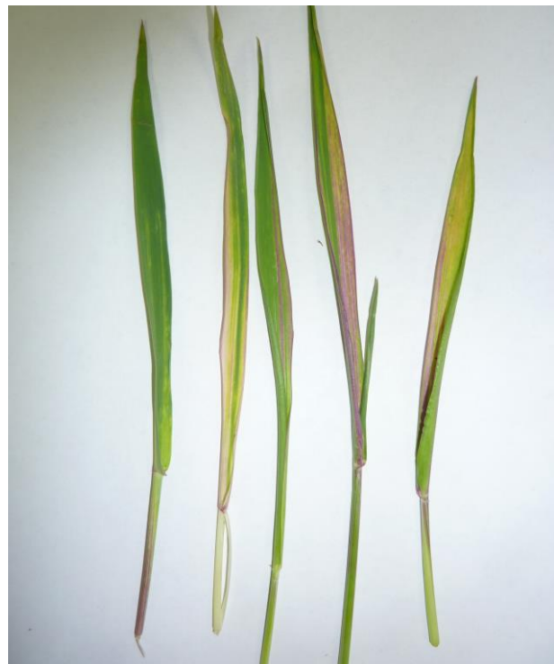
Leaf colour variation (left leaf) caused by Russian wheat aphid feeding.

Initially Russian wheat aphid feeding causes a small light brown blotch that can be confused with damage by other insects and more problematically with symptoms caused by disease.