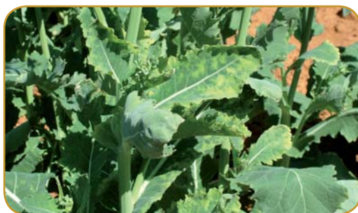
Manganese toxicity symptoms in canola at Culcairn