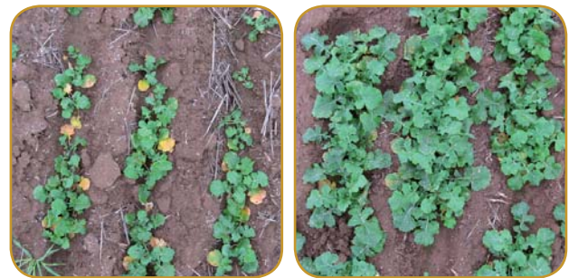
Deep ripping (right) resulted in more dry matter at Greenethorpe than the unripped control (left). However the season was too dry for these responses to translate into a yield benefit.

Despite removing the compacted layer, deep ripping resulted in a dry matter response at the two Greenethorpe sites only. Poorer growth in ripped plots at the other sites may have been due to a combination of greater moisture loss from soil disturbance in a very dry season, and in some cases, from poor seedling establishment where the ripper left a rough seedbed. Unfortunately the season was too dry for these dry matter responses to translate into a yield benefit.