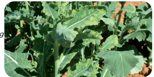
Figure 2: Canola showing symptoms of manganese toxicity.

can also affect canola growth through reduced photosynthesis (Figure 2). Manganese toxicity is commonly seen at the seedling stage and/or flowering time, often in waterlogged soils at the end of winter as soils warm up. Although plants appear to overcome the toxic effects of manganese as the season progresses, ◊ the effect of reduced photosynthesis on final yields is still unknown.