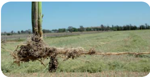
Figure 1: Stunted canola roots resulting from high levels of aluminium in the subsurface.