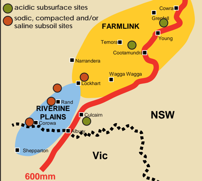
Figure 3 - Location of 2007 trial sites:

*all plots at Culcairn also received additional surface applied lime (1t/ha) in early May. 'nil' treatment included +/- fungicide.